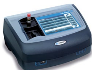
Benchtop and portable instruments for lab analysis Inspection, maintenance and equipment qualification services available

* For additional parameters and solutions please contact your local HACH LANGE representative or visit our website.