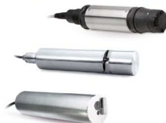
Controllers and sensors for online analysis and cost-saving process optimisation